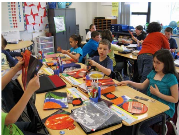
Worden Elementary students working on solar projects.

It was an extremely rewarding experience to have been able to do this mini-outreach, but what was even more rewarding and unexpected was a gift from the students. They all wrote me a personal thank you that explained what was their favorite part of the presentation and what they saw in the scope. They then bound it in a nice spiral book. It is a keepsake to be added to my library!