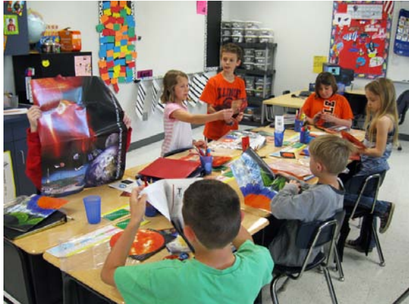
Worden Elementary students working on NASA space projects.

It was an extremely rewarding experience to have been able to do this mini-outreach, but what was even more rewarding and unexpected was a gift from the students. They all wrote me a personal thank you that explained what was their favorite part of the presentation and what they saw in the scope. They then bound it in a nice spiral book. It is a keepsake to be added to my library!