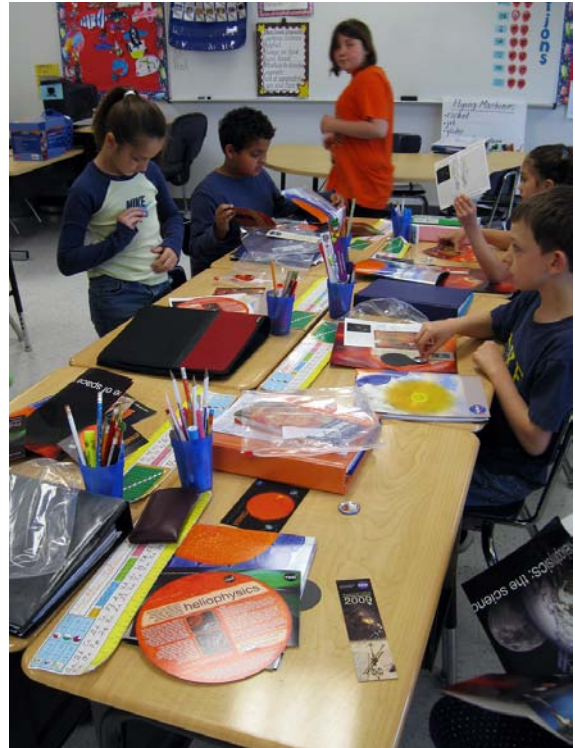
Worden Elementary students working on solar projects.

The presentation took about 2 hours with both going through the provided materials and viewing time through the telescopes. I also discussed the differences between a reflector telescope and a refractor telescope. I showed them the mirrors and the lenses associated with both types of scopes. I also passed around the Celestron Sky Scout personal planetarium so they could see it also.