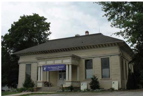
The Edwardsville Children's Museum.

The Moon will be at Last Quarter so it will not be visible for the event. We will set up telescopes for show-and-tell and solar observing. If you have a solar filter, remember to bring it! Attach it securely to the front aperture of your telescope for this event. Instruct children and parents that observing the sun is dangerous and to consult a qualified amateur astronomer before attempting it!