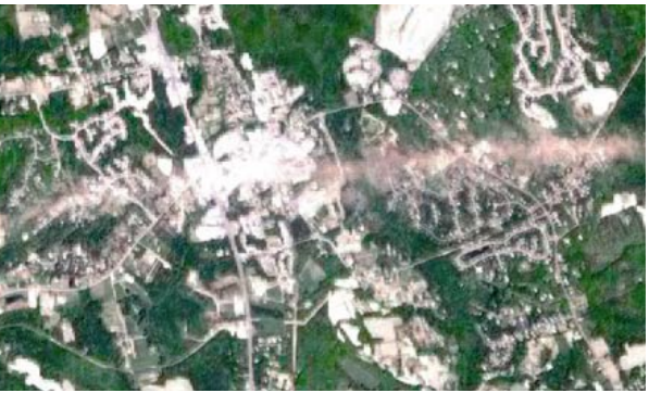
These images, made from EO-1 data, are of La Plata, Maryland, before and after a tornado swept through on May 1, 2002.

Flight Center. Now, almost three years after it was scheduled to be de-orbited, EO-1 is still collecting valuable data about our planet's natural ecosystems. Scientists have begun more than a dozen environmental studies to take advantage of EO-1's extended mission. Topics range from mapping harmful invasive plant species to documenting the impacts of cattle grazing in Argentina to monitoring bush fires in Australia.